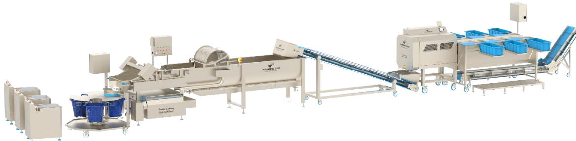
VWM-5000 in a vegetable processing line for cutting, washing and drying vegetables

The VWM-5000 vegetable washing machine is designed to wash cut vegetables such as cut lettuce, leek, carrot etc. The VWM-5000 goes perfectly together with the belt cutting machine BCM-3000, the conveyor belt HCB-600-TS and the centrifugal dryer in a complete vegetable processing line.